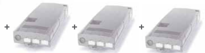
Possibility to connect up to 4 control boxes = up to 12 actuators and 2 motor groups