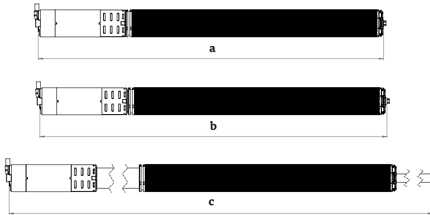
Dimensions a, b, and c according to Technical Data